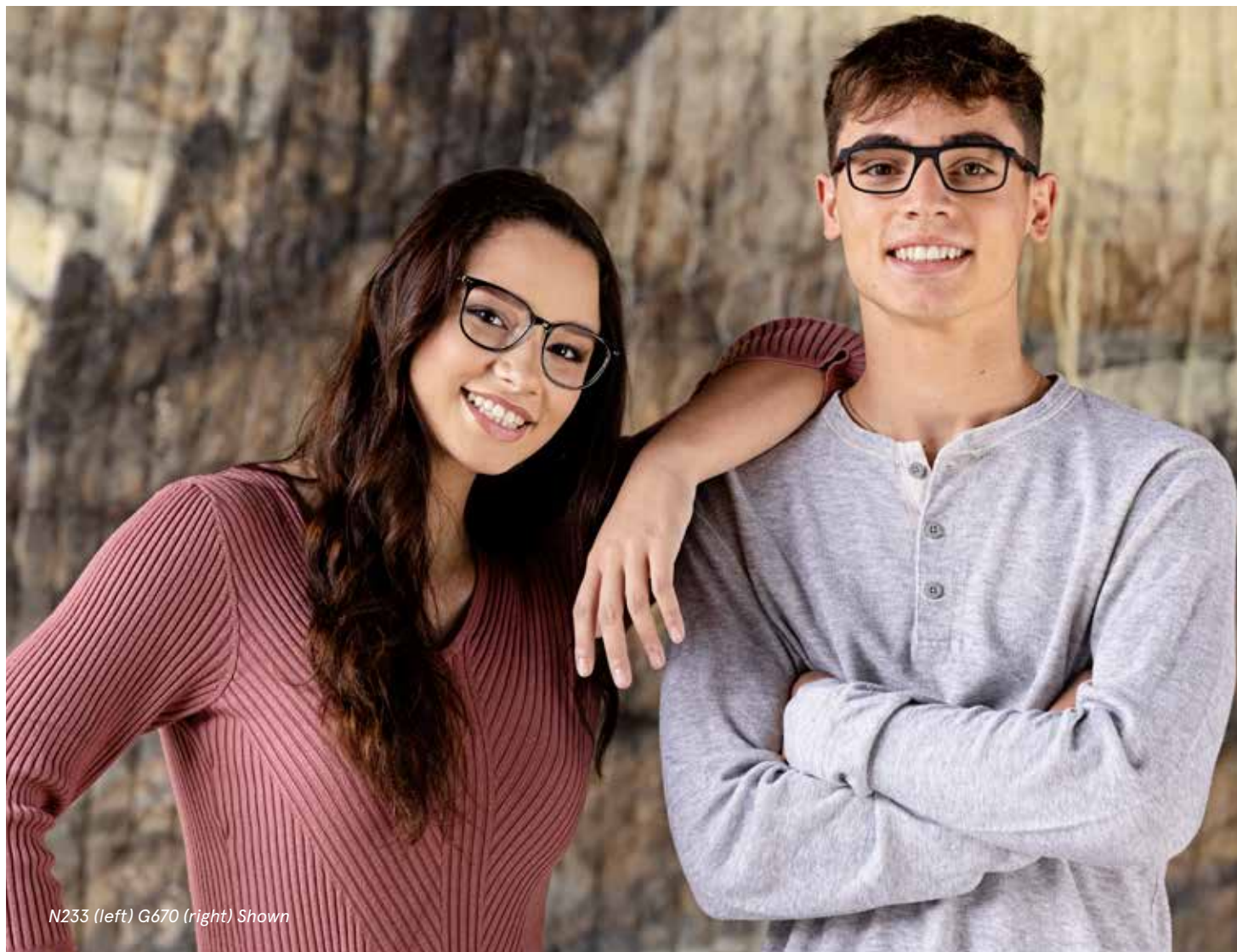
N233 (left) G670 (right) Shown

Why blend in when you can stand out? NRG offers both style and value along with the cutting-edge designs your customers want. SD EYES believes that fashion should be accessible to everyone, so we created the NRG line of high quality well-constructed frames for today's fashion conscious youth.