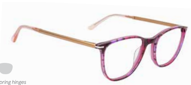
C1 Berry Marble