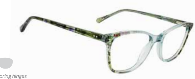
C2 Teal/Green Mosaic