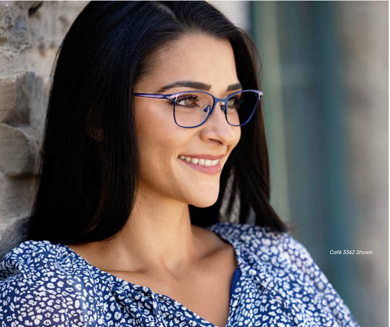
Café 3362 Shown

FOR WOMEN WANTING TO MAKE A STATEMENT WITH THEIR EVERYDAY EYEWEAR.