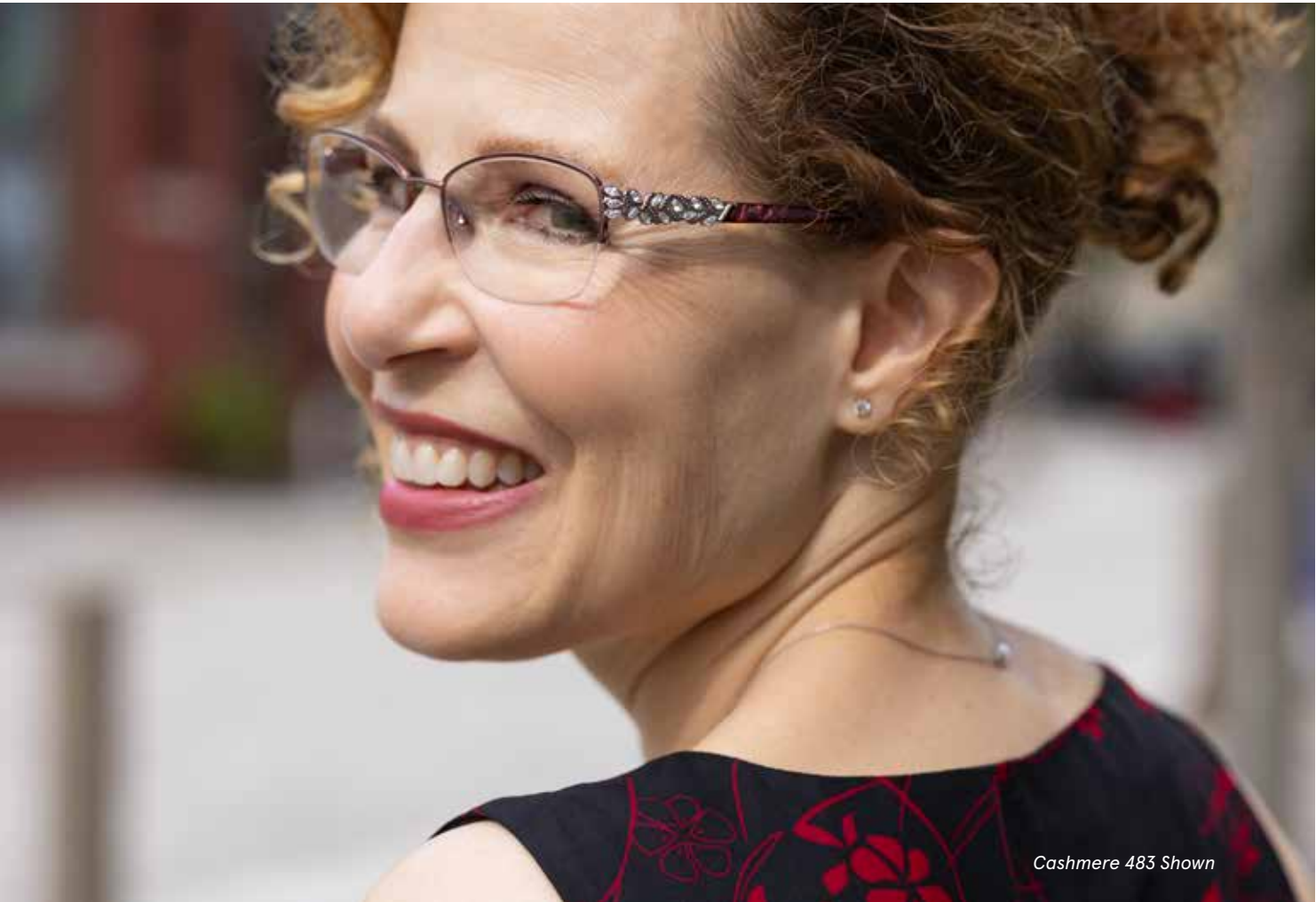
Cashmere 483 Shown

FOR WOMEN SEEKING A LOOK OF REFINED ELEGANCE.