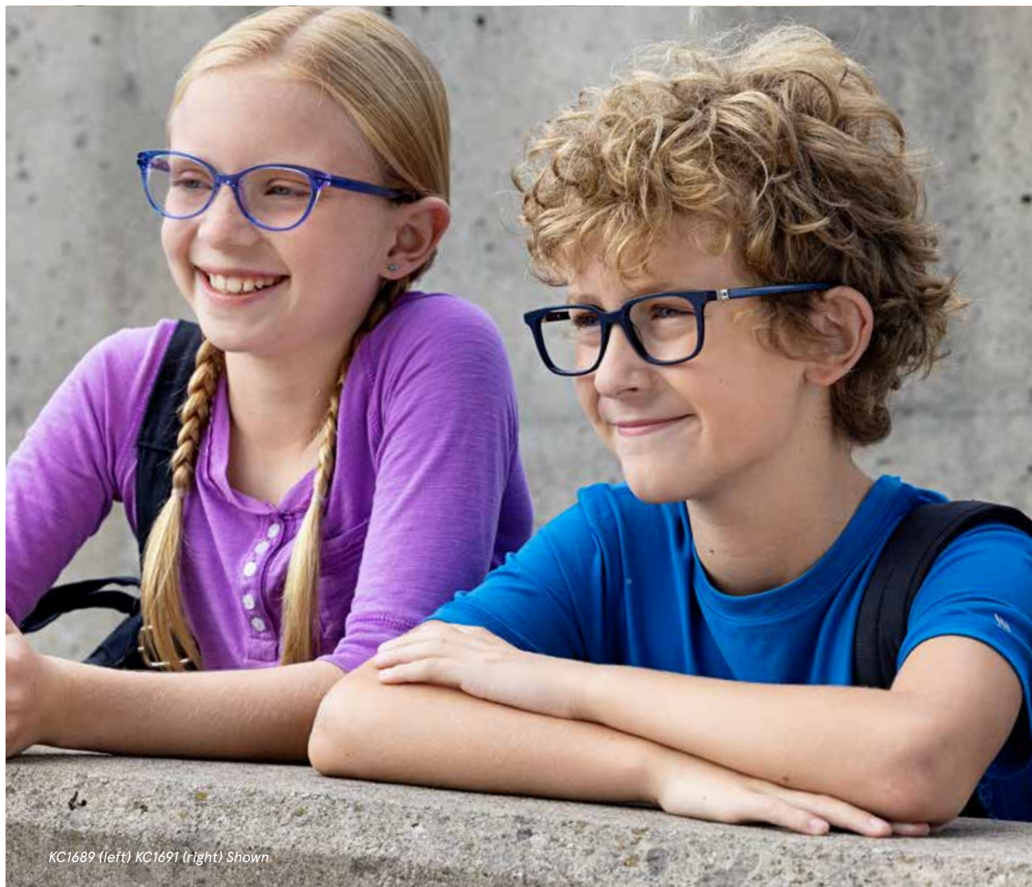
KC1689 (left) KC1691 (right) Shown

Kids want to be hip too, so SD EYES created a line of frames that are fun, imaginative, playful and rugged. With styles designed to grow with your kids, the Kids Central lineup offers long-wearing comfort and the latest trends that kids will be drawn to.